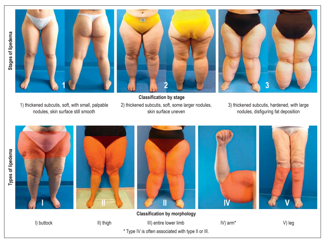
Figure 1: the staging and typological classification of lipedema